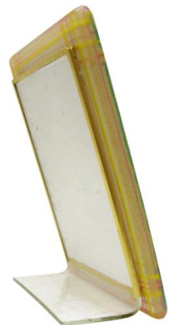
Slumped glass easel made with Bend It Mold #806174.