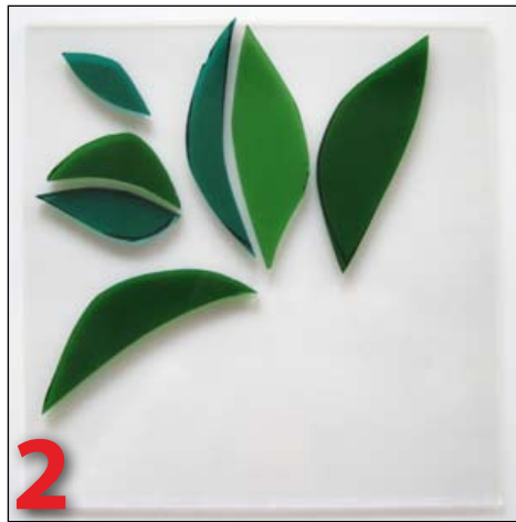
2 Using a loose, curving motion, cut large and small leaf halves out of various shades and begin laying them out on the Base.