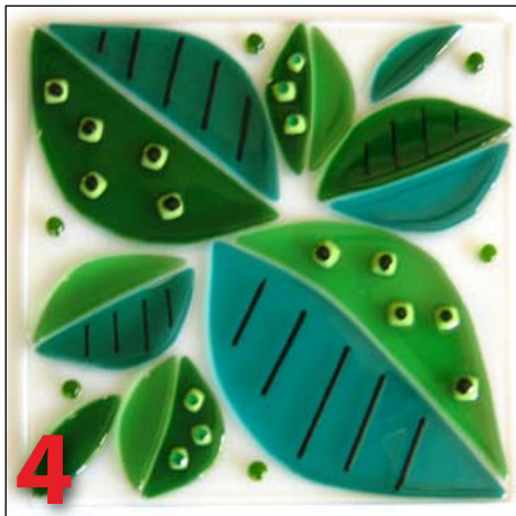
4 Arrange leaves on Base, embellishing with stringer and smaller accent glass pieces, as desired. Contour fuse and slump.