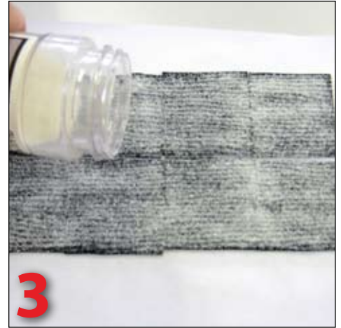
3 Lightly sprinkle your first color of fine opal Frit into the valleys of the texture on 8 of the squares.