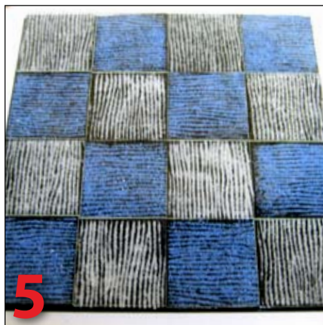
5 Place Frit-topped squares onto base, alternating the color and grain of each as shown. Top with 2-inch Clear squares (if desired) for added depth. Full Fuse, Slump.