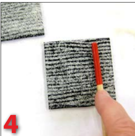
4 Pat down the Frit with the end of a brush or similar tool to expose the ridges. Spray again with hairspray to hold. Repeat steps 2-4 using your second color of Frit.