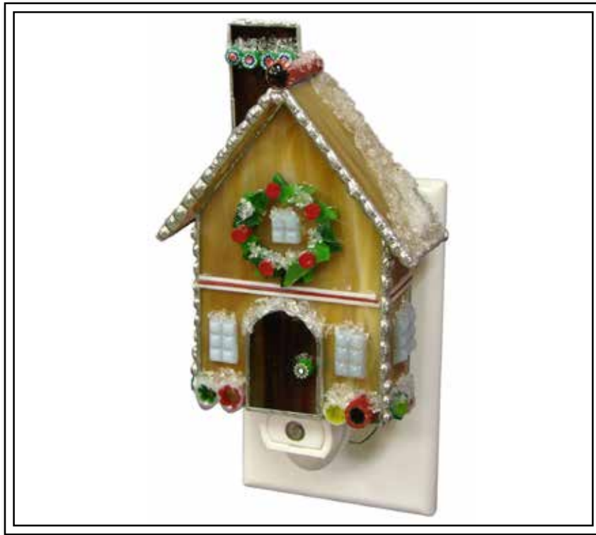
Artist: Julie Haan

Light up the night with this sweet little gingerbread cottage night light. From roof to doorway it is sure to add sparkle to the holiday season.