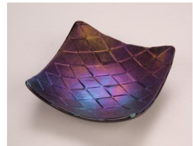
Clear Iridized and Black fused together on #80633 Harlequin Texture Mold and slumped