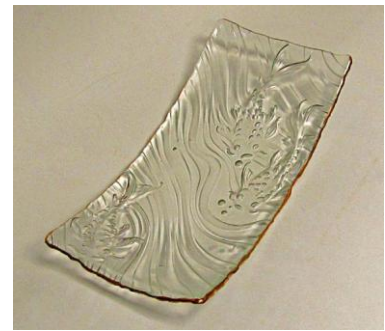
Double Thick Clear with fired gold border, textured on #806169 Koi Texture Mold (below) and slumped