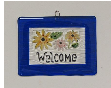
Standard Thickness 96 COE clear over a border of Cobalt Blue with wire U-hook inclusion, textured on #806168 Welcome Mold (below) and painted post firing on reverse with non-fired paints