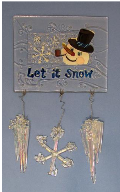
Double Thick Clear glass, textured on #806172 Snow Mold (below) with U-hook wire inclusions to hang fused snowflakes/icicles. The textured glass was painted on reverse using non-fired paints