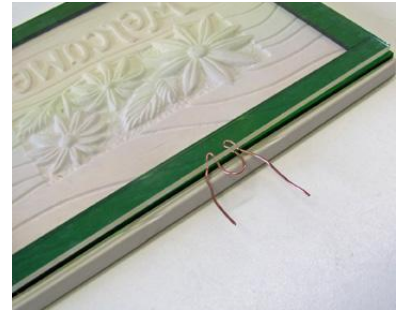
Bare copper wire is positioned between fusible glass accent strip border and compatible standard thick clear