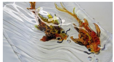
Paints applied to the textured side and viewed from the reverse